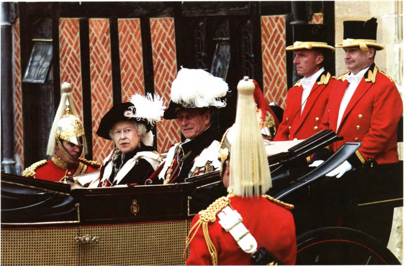
Above: HM The Queen and HRH Prince Philip at Windsor Castle on Garter Day 14 June 2010. 2480x1653 pixel crop (200mm equivalent) from the original 5212x3468 pixel image, yet the resolution holds up well. 90mm f/2.8 Tele-Elmarit 1/750sec at f/4 and ISO 800.

still whisper quiet when compared with most DSLRs.