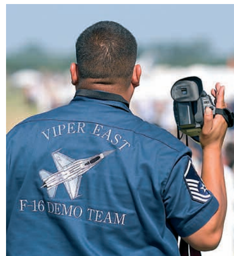
ABOVE: This member of the USAF Viper East F-16 Demo Team was about 50 yards away from the camera but the Sigma 300–800mm zoom is so sharp that every fibre of his clothing can be seen at 100% and the time on his wristwatch can easily be read. Note the beautifully out of focus backgrounds.